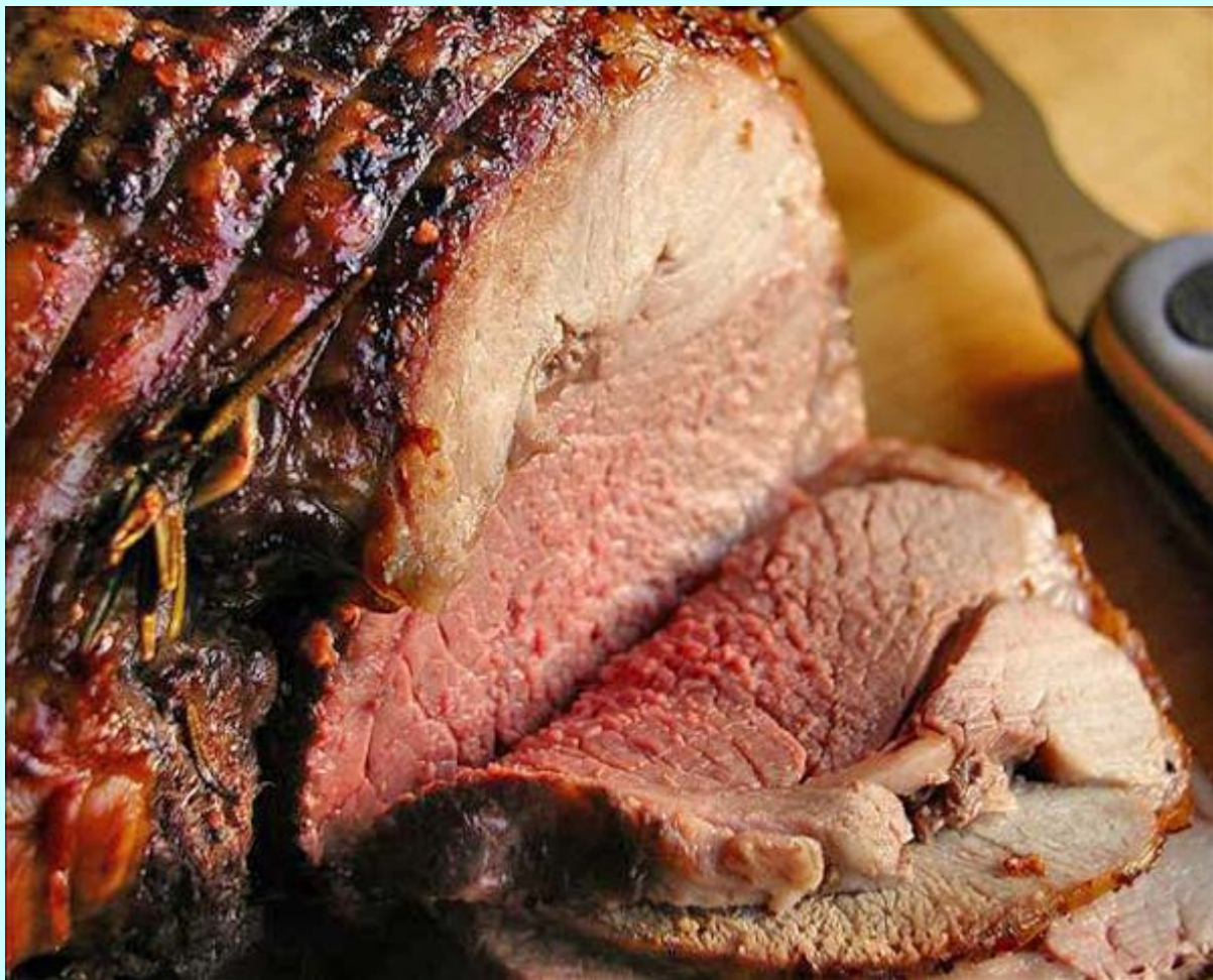
Roast leg of lamb with Rosemary and garlic.